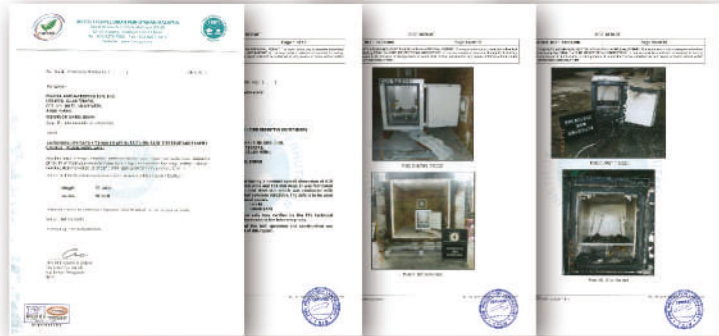
JIS S 1037 : 1989 FIRE RESISTIVE CONTAINERS

A time delay lock-out is activated if the false number is entered more than 3 times.