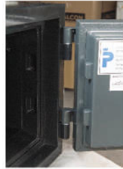
Tongue & Groove